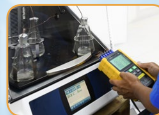
Temperature Sensor Calibration