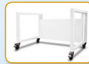
Support Stand with Caster Wheels