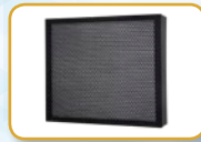
Carbon Filter (Type A-Type H)