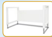
Support Stand with Leveling Feet