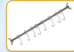
Stainless Steel IV Bar (for VA2 only)