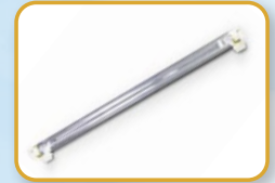
UV Lamp (for VA2 only)