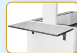
Foldable Side Tray (for VDA only)