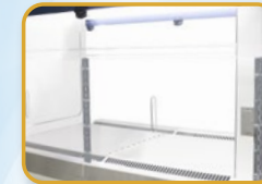
Side Shield (for VDA only)