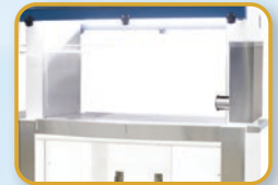
Feed Hopper (for VDA only)