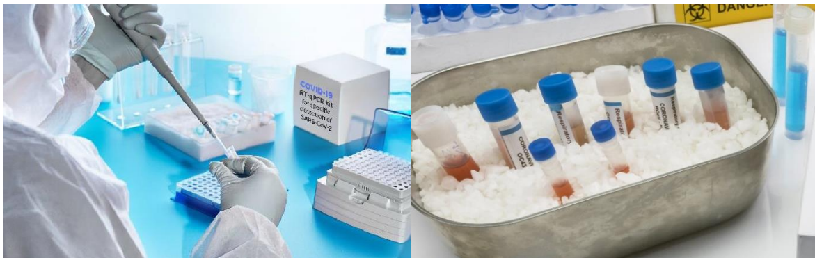
PCR master mix and reagent preparation for diagnostic testing