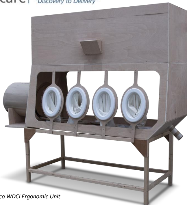
Esco WDCI Ergonomic Unit